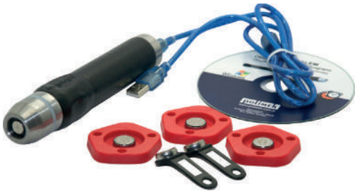
TOM Touch Memory