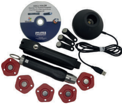
TOM Touch Memory